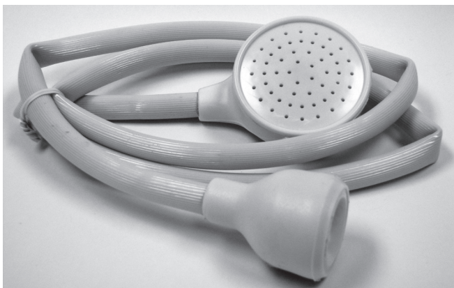
Hand held shower head