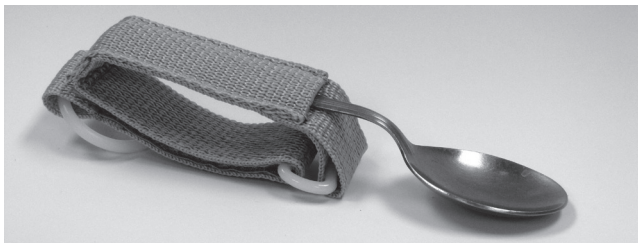
Hand strap used to hold all types of utensils