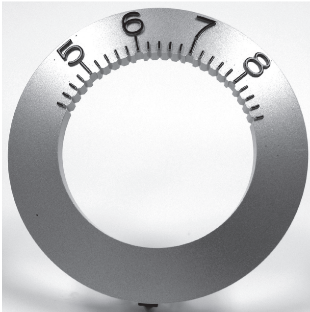
Thermostat that features large numbers and raised temperature settings